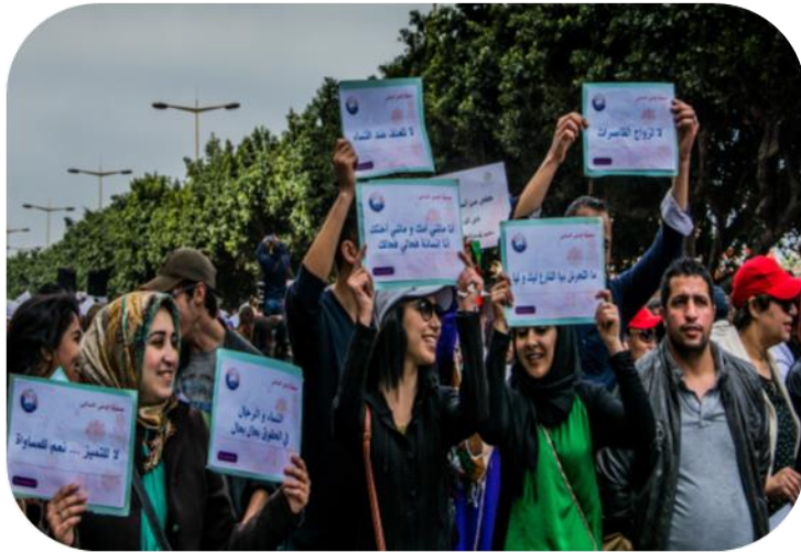
Harmonizing national legislation with the 2011 Constitution and international norms