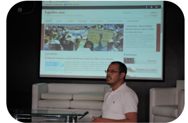
Supporting civil society's advocacy efforts for legislative change and its role in monitoring and evaluating public policies