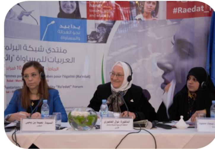
Strengthening institutional accountability towards gender equality